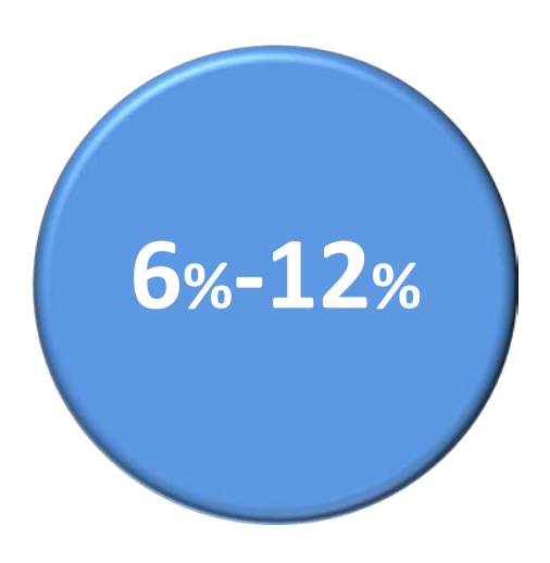
Avg Min/Max Employer Contribution