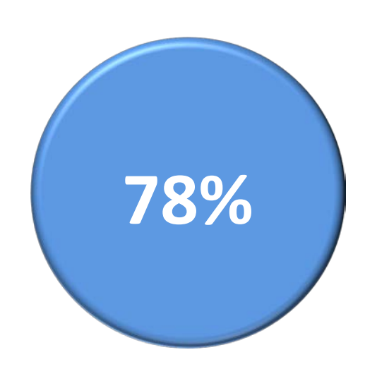
Not Considering Master Trusts